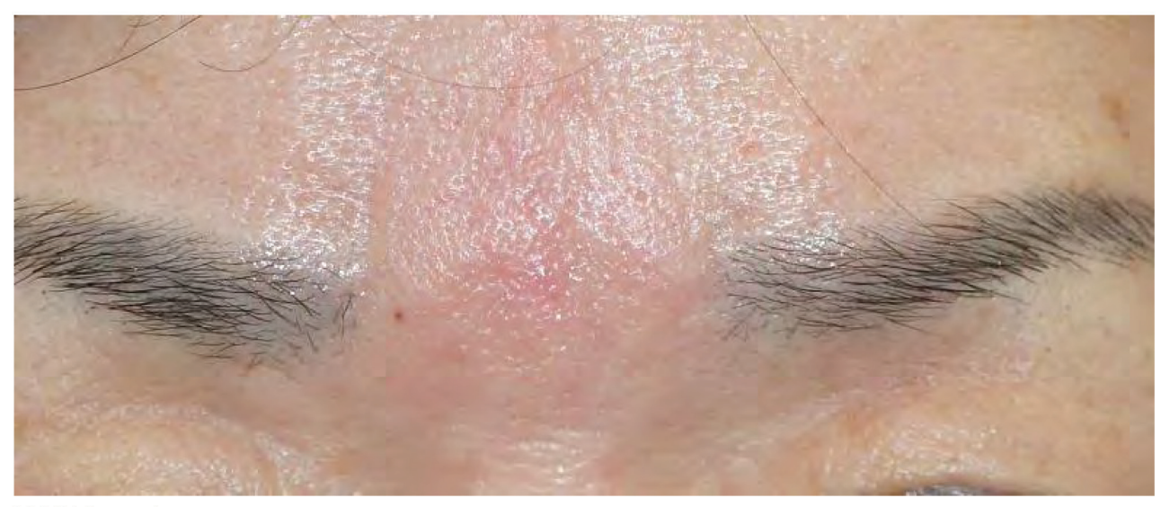
M 30Y, 8 months post treatment After