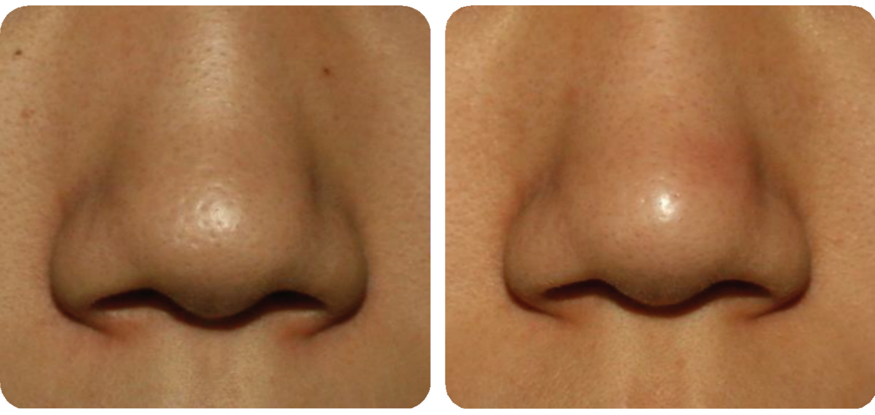
SRR + microneedle, 1 month post