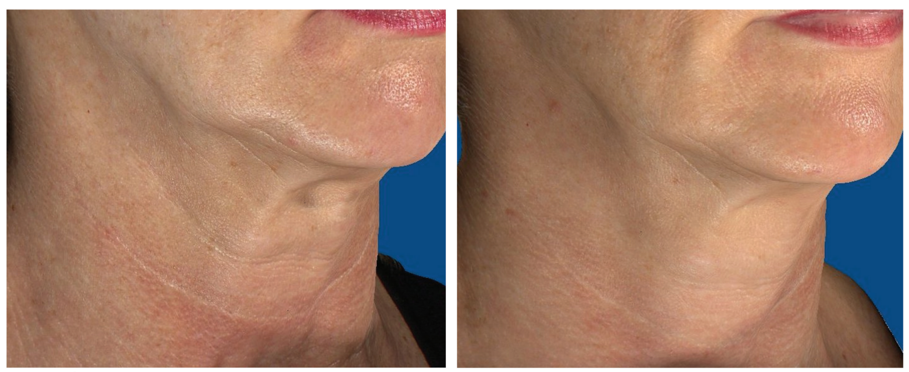
F 58Y, 5 weeks post treatment