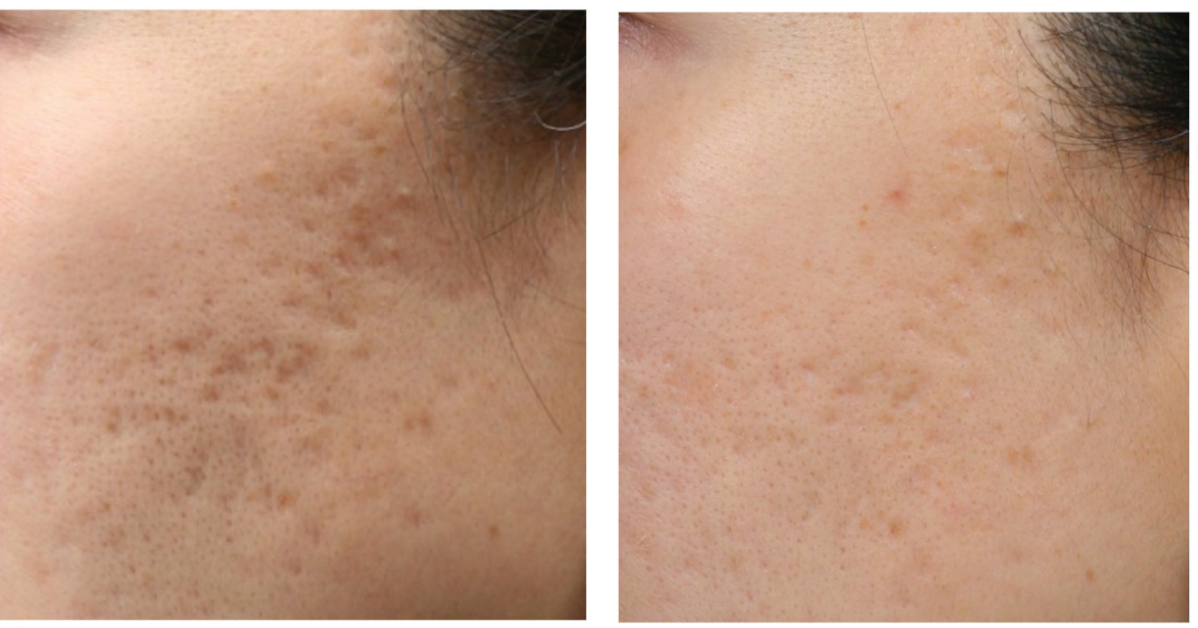
F 37Y, 1 month post treatment