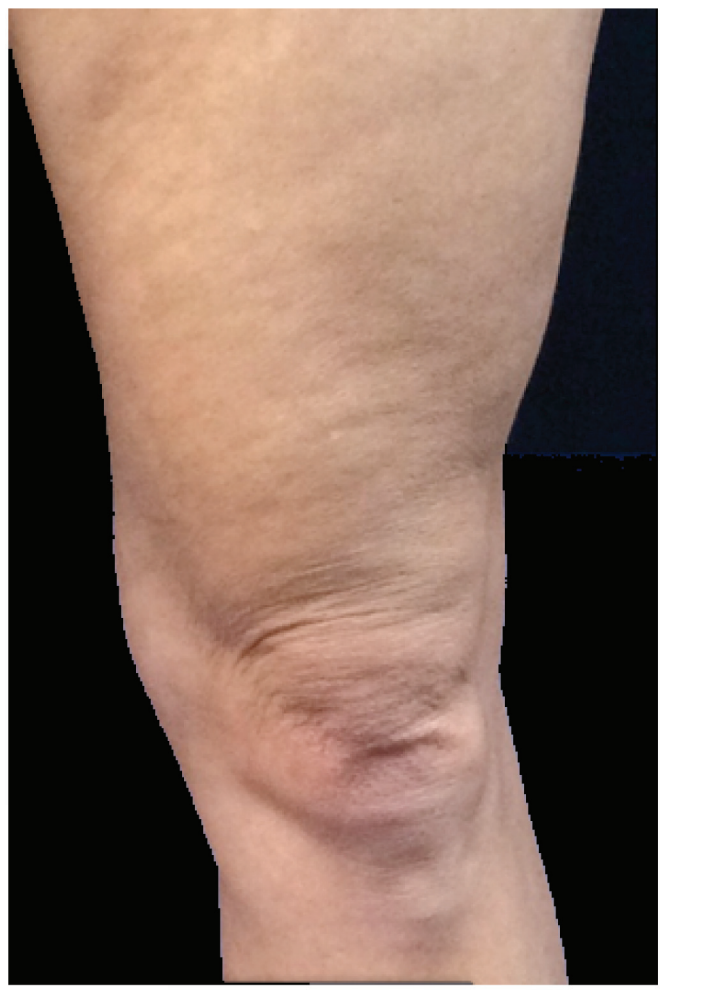
F 39Y, 2 months after a single treatment Before