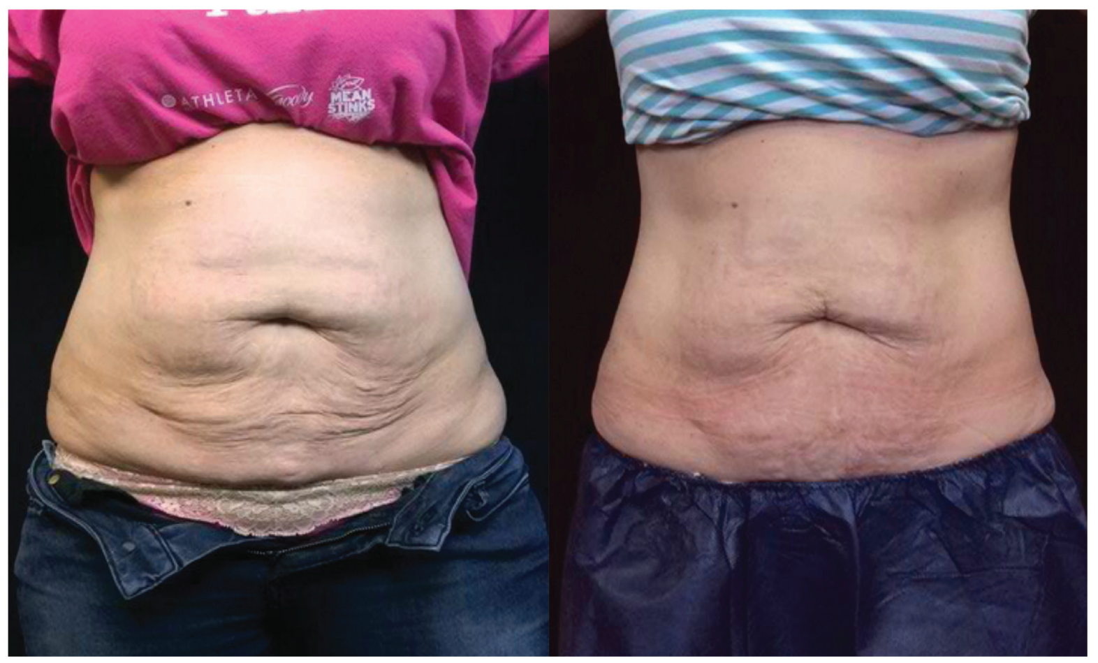
F 33Y, 1 month after 2nd monthly treatment