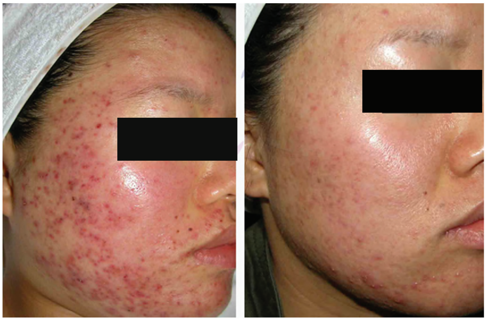
F 27Y, 1 week post 2nd treatment