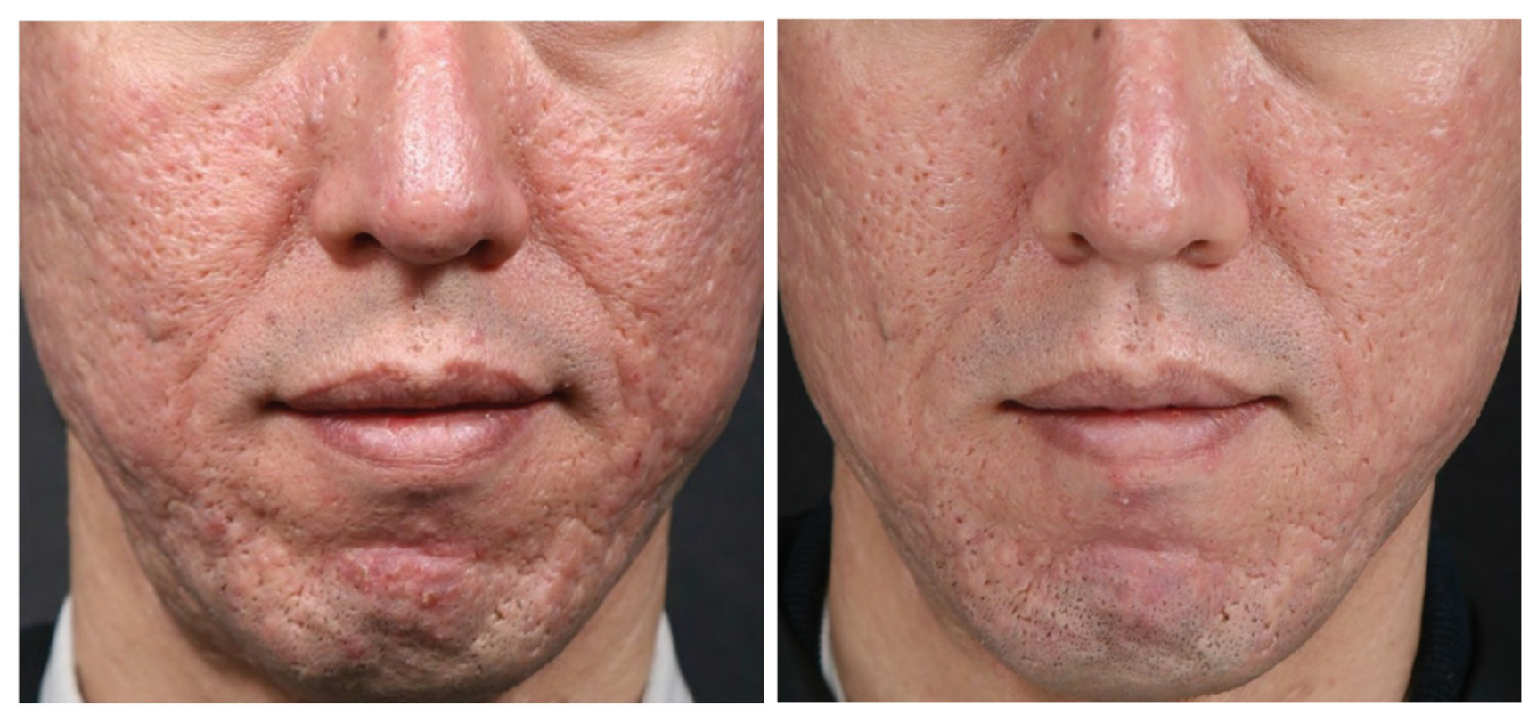
M 42Y, 7 days post treatment