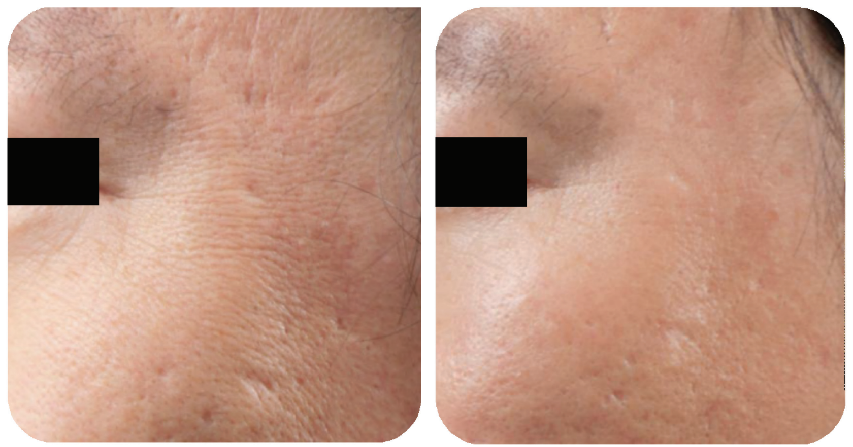
F 40Y, 4 weeks post 2 sublative SRR