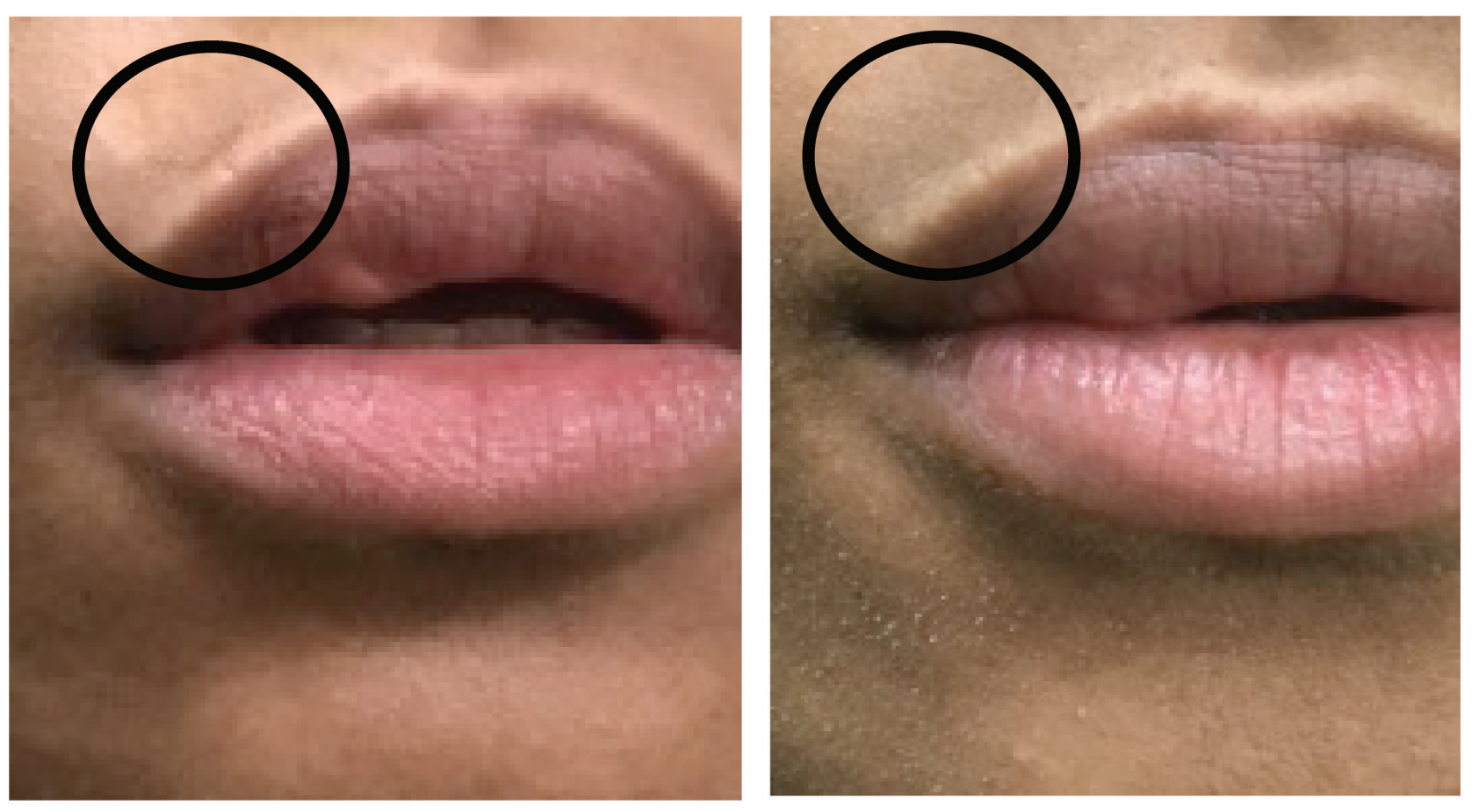
F 22y, 1 month post treatement