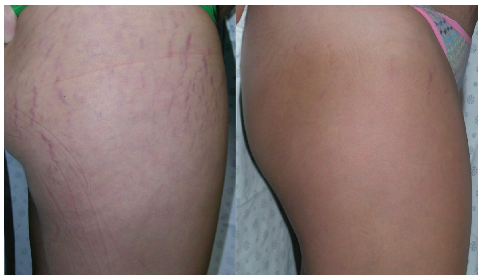
F 26Y, 1 month after a single treatment