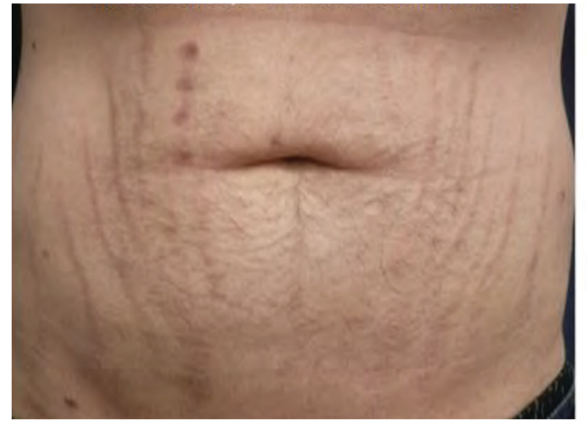
1 month post 2nd treatment