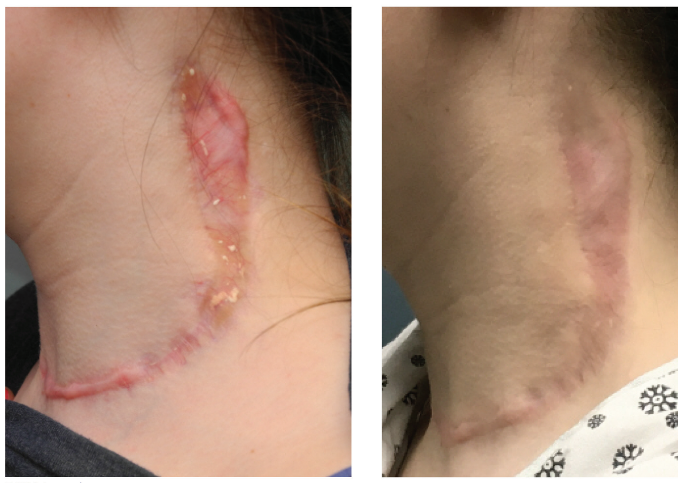
F 38Y, 1 month post treatment